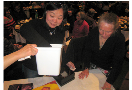
Picking a winning raffle ticket