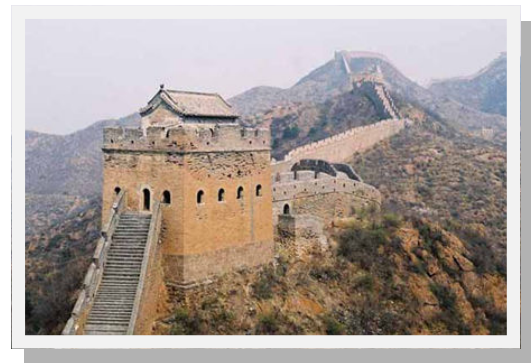
Restored section of Great Wall