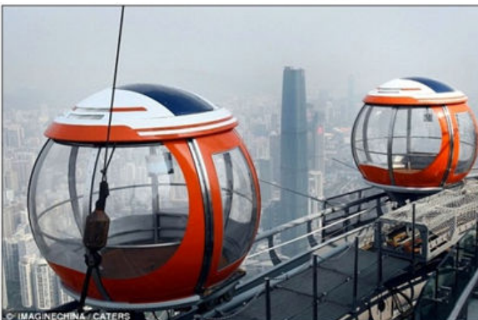
Sky's the limit: Each capsule is just over three meters wide, and built using a special macromolecule material which allows a 360-degree crystal clear view