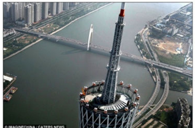
Riding high: This is the world's 'highest' Ferris wheel on top of a 1,480ft tower in China - with passengers riding in see-through pods