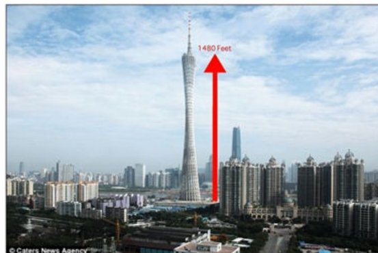
Sturdy: Unlike other Ferris wheels this has a 15-degree incline and can resist 8-magnitude earthquakes and Beaufort scale 12 typhoons