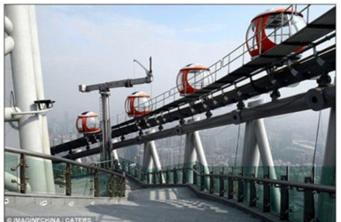
Great view: Built on the 450-meter-high Canton Tower, the amazing wheel consists of 16 pods holding a total of 96 fearless passengers