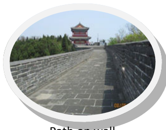
Path on wall