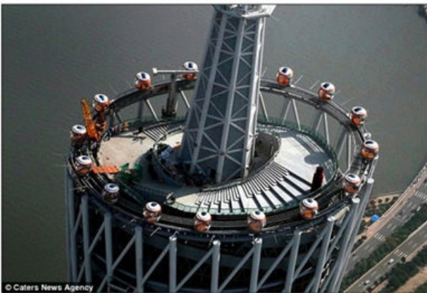
On top of the world: An elliptical track has been constructed around the edge of the tower's roof, and the 16 transparent 'crystal' pods take between 20 and 40 minutes to go round the track

Chinese companies are now competing with the likes of GE, Westinghouse, ABB etc to build power plants and massively sophisticated infrastructure — and beating ALL of them hands down!! NOBODY CAN COMPETE WITH CHINA!! Countries and companies that align with Chinese companies will become super powerful as China and Chinese companies have a long tradition of "Guan-Xi".