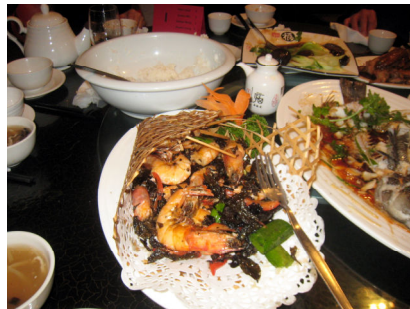
Yummy - Spicy prawns with oolong tea