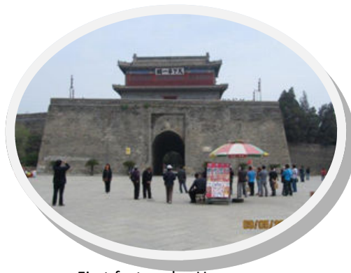
First fort under Heaven