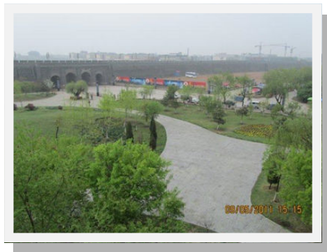
Inside city fort